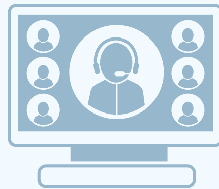
ONLINE TRAINING & WEBINARS