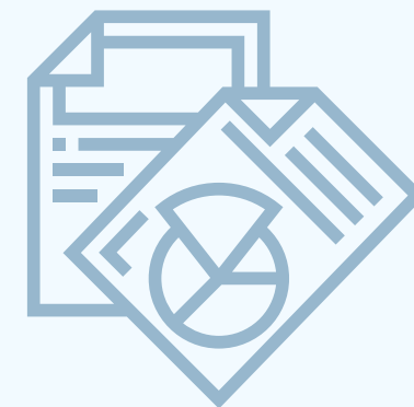
REPORTS & PUBLICATIONS